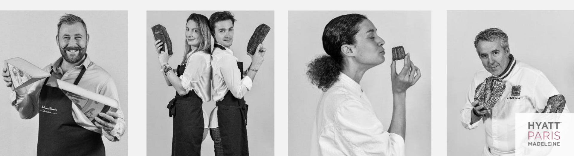
Best Artisans of Paris